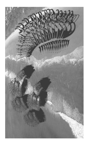
Fig. 4. Plan

The coral forms in the water depict a complex "growing" structure. At the location of the shoreline, the polyps grow in a radial for simplifying the structure and revealing a place for human habitation. This structure is the fish market. The fish market curves around the shore and is designed using three different forms: a form for gathering/sitting, a form which creates the actual marketplace