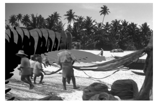
Fig. 2. Market fishermen untangling nets